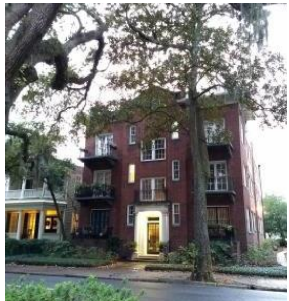
Whitaker Street 28 DUA on the block