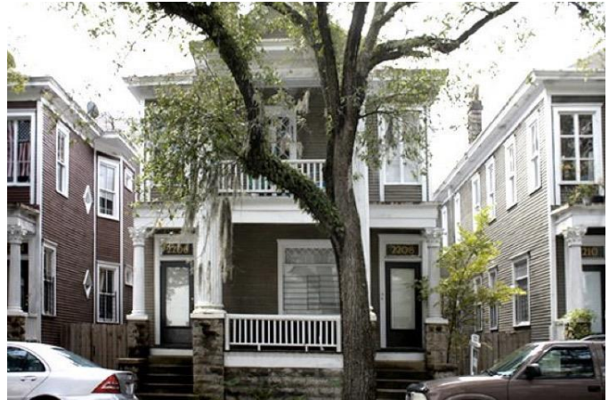
Bull Street has 18 dwelling units per acre (DUA) on this block