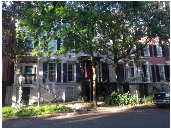
Jones Street has 47 DUA on this block